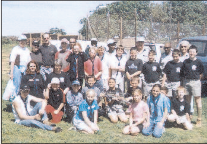
The hunt party 'show off' the snares they had collected

On Monday 30th September, 1st Cotswold Cubs and Scouts with girls and boys of St Croix Sea Scout Group and members of the public, searched the Aloes Nature Reserve for snares. The Cotswold boys collected 22 snares between them. The Snare Hunt was organised by the Swartkops Trust and the Metro. For those of us who appreciate wild flowers it was an unforgettable outing.